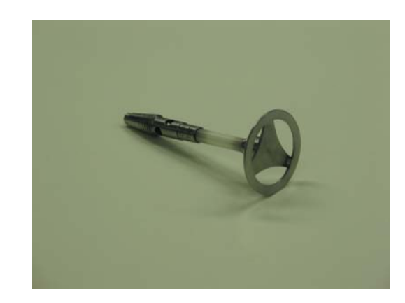
Figure 2: Newly designed ring rotor (order number 222-1789)

Figure 1: Storage modulus G' and loss modulus G" versus time for a polyurethane sealant, determined with a) 20 mm plate-plate geometry and b) newly designed ring rotor at ambient conditions, f = 1 Hz, \gamma = 1 %.